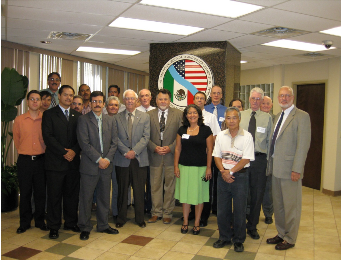
Figure 3. Project team members participate in binational meeting of the IBWC, August 20, 2009.

conducted in 2010 and 2011, and is summarized in the Accomplishments section (Mexican Geological Service, 2011a and 2011b). Additionally, eight binational meetings were held to coordinate research activities and provide scientific exchange and data sharing.