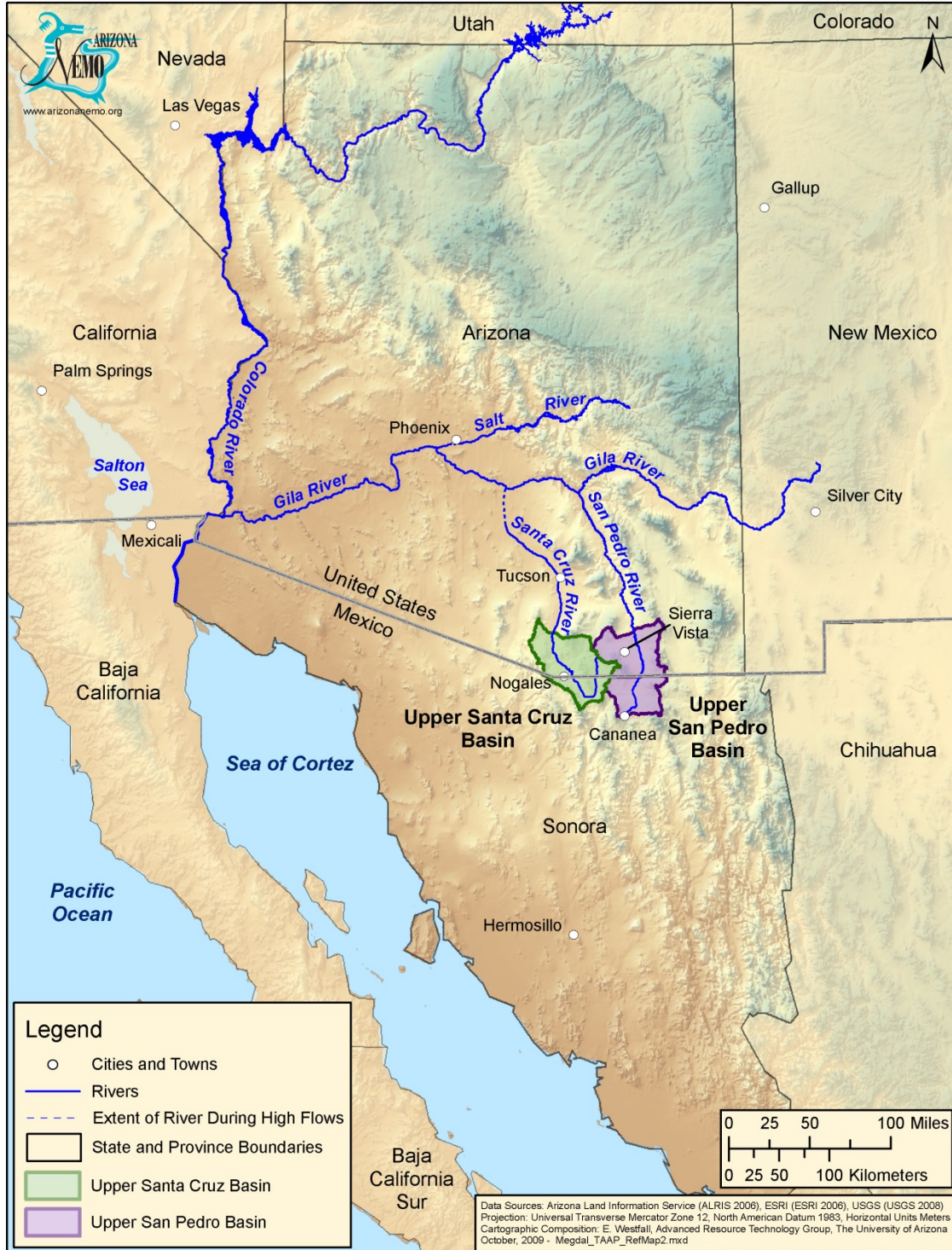
Figure 1. Locations of Upper Santa Cruz and Upper San Pedro River Basins (adapted from Megdal and Scott, 2011).